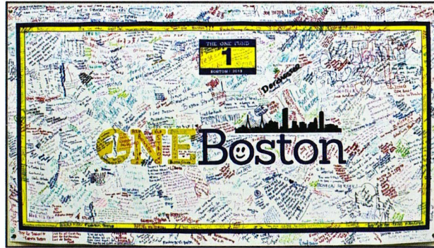
"One Boston" banner, 2013 Marathon Bombing Temporary Memorial collection (Collection 0247.004)