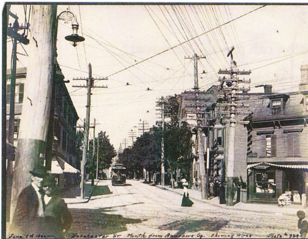
Dorchester St. North from Andrew Square showing wires, 1902