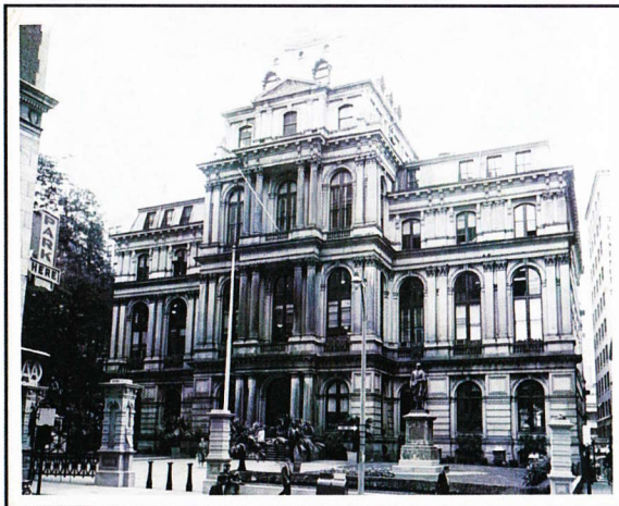
Old City Hall, School Street, circa 1960 Mayor John F. Collins records (Collection 0244.001)

As the official archives of one of the United States' oldest and most historic cities, the City Archives represents an invaluable resource for not only local heritage and history, but for the history of the nation.